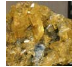
Figure 1: Mineral Barite ( \text{BaSO}_4 )

The element Barium (Ba) occurs primarily in sulphate as Barite ( \text{BaSO}_4 ), and as a carbonate in Witherite ( \text{BaCO}_3 ). Barium may also occur in substitution for K-Ca in silicate minerals, most notably as a substitute in K-feldspar. Sr and Ca may substitute for Ba in barite and Witherite. Barite occurs in base metal deposits, with gold deposits, and may form fine grained black bedded barite in sedimentary sequences. The Carlin gold deposits of Nevada USA contain a beautiful honey yellow barite crystals along open fractures and voids within the deposit (Figure 1).